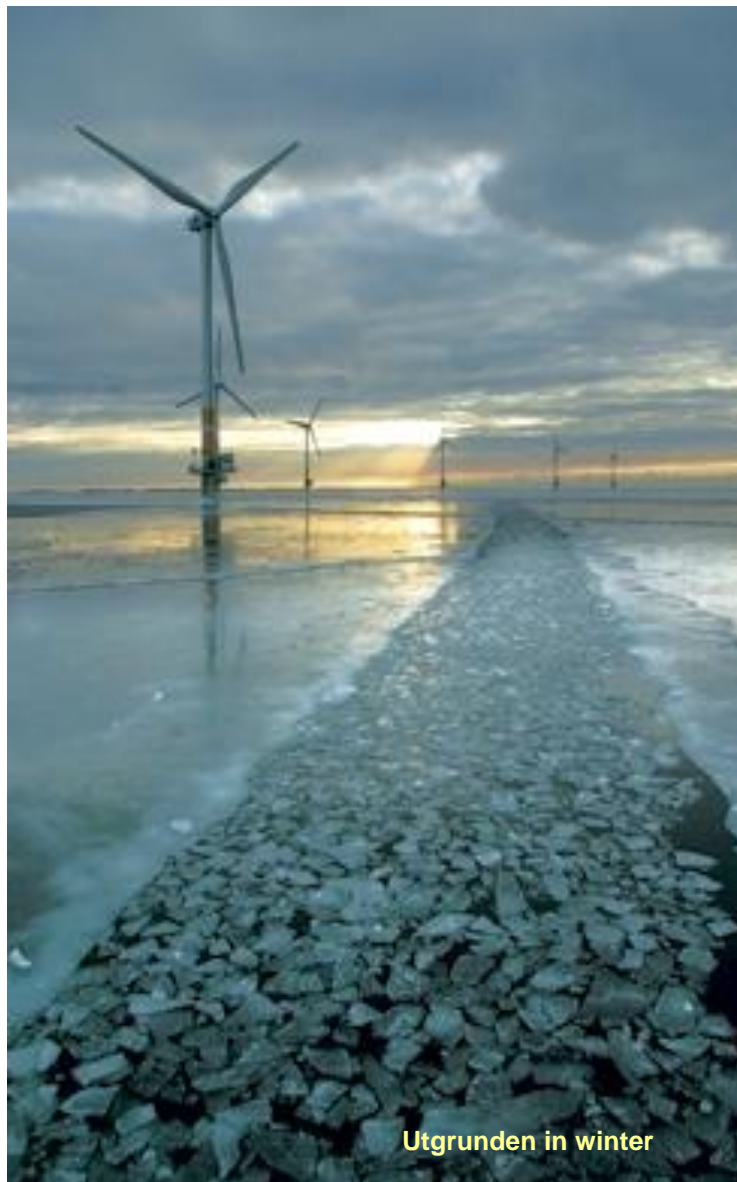
Utgrunden in winter

But less criticism does not necessarily mean increased acceptance. Declining criticism could just as well be due to resistance being considered as meaningless.